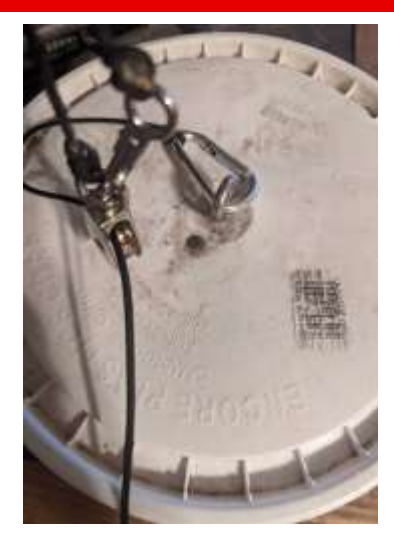
Scion (lid) with rope attached to eye screw and pulley