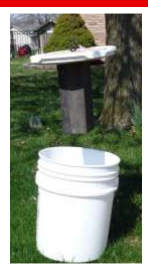
Lower scion with swarm into waiting bucket