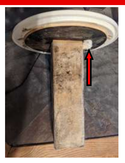
Finished scion with wax coated board and cotton ball with lemon grass