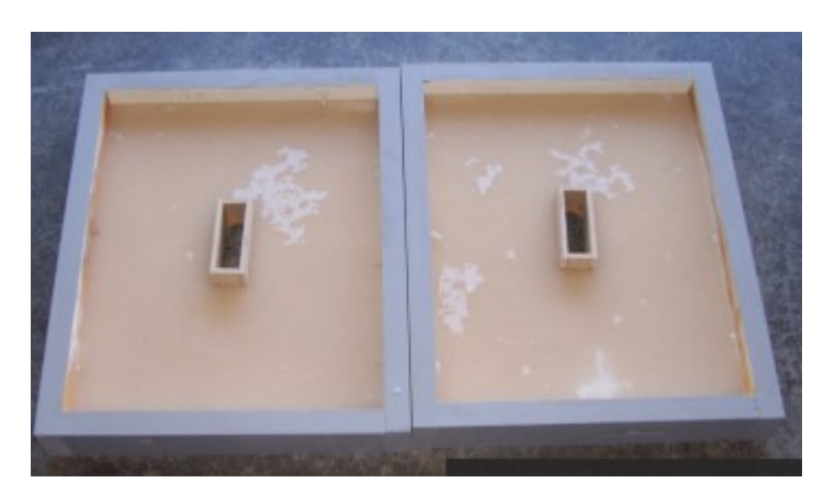
Trays for bee candy

CAUTION: be very careful, the heated candy will give you a <u>VERY</u> <u>SERIOUS</u> burn if it contacts skin.